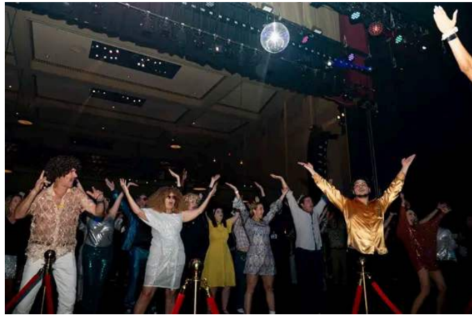
In Photo: 'It's fun to stay at the Y-M-C-A!'